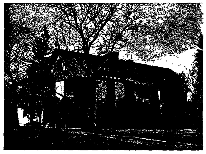
SCENE OF THE evening planned for those who attend the club dance tomorn night is the Arlington Officers' clubhouse, Third road and Park drive

Preparations are being made for an unprecedented crowd, since that is the