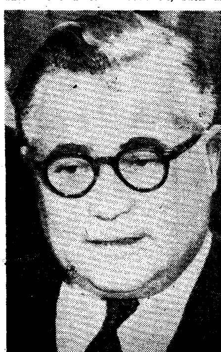
VLADIMIR PETROV ... at Royal Commission hearing.

Atomic research espionage, technical advances and new inventions, such as